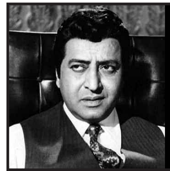
Pran in his heydays

In the Indo-Caribbean community from Guyana, Surinam and Trinidad, people loved Indian movies. Pran was always seen as a very powerful actor. We knew that he played villain and negative roles, but his character uplifted hero's role, in the sense his character delivered more good in the end. We were in awe of him in admiration as well in fear. Pran made a place in people's heart in the indo-Caribbean community. We are so proud that he has been given the highest film award even though so late in life, but better late than never. He will always be remembered for his versatility, boldness and charisma.