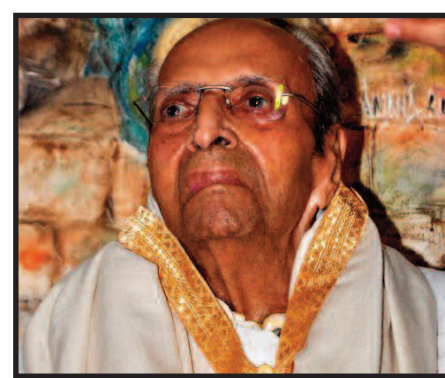
Pran was honored earlier this year with Dada Saheb Phalke Award