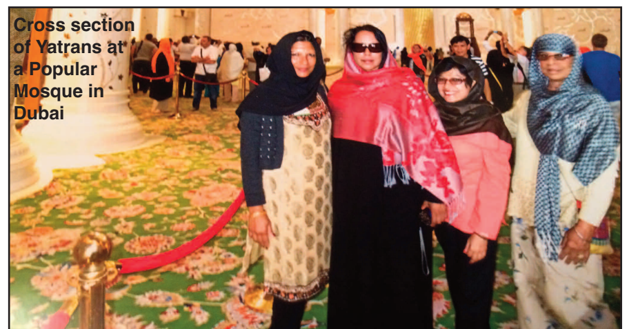
Cross section of Yatrans at a Popular Mosque in Dubai