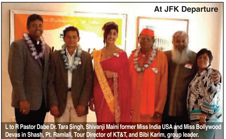
At JFK Departure