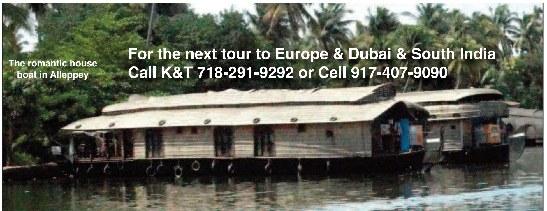
The romantic house boat in Alleppey