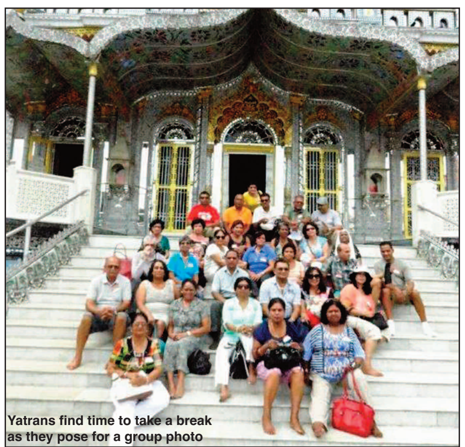
Yatrans find time to take a break as they pose for a group photo