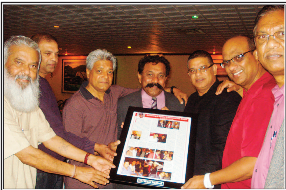
A special moment at the popular Kaitaur Restaurant in Richmond Hill New York the place where the dynamic trio-performs every Sunday from 8:00 to 12 PM