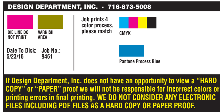
1.5" X 4.5" Die created by Design Department